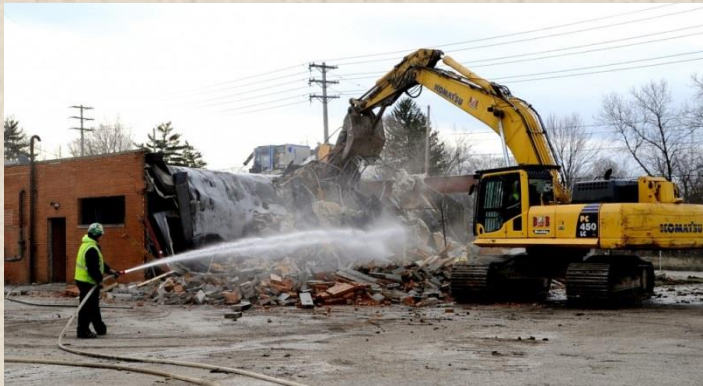
Heinen's Expansion – Warrensville Hts., Ohio