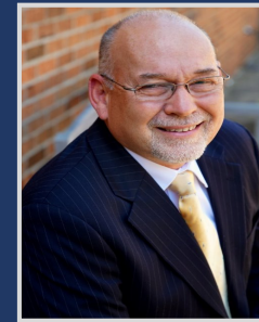
Jim Justice Ashland County