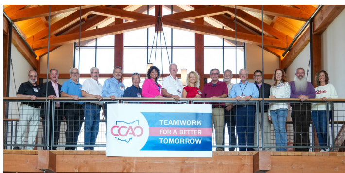
CCAO members gather on the top level of the Hocking Hills Lodge & Conference Center during the 2024 CCAO Summer Symposium for a photo (see the bottom half of this photo at the top of this page).