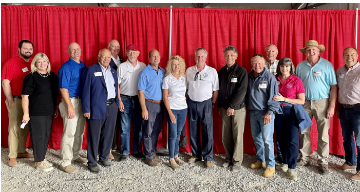
CCAO Staffers and Members attended the 2024 Ohio State College of Food, Agricultural, and Environmental Sciences Farm Science Review.