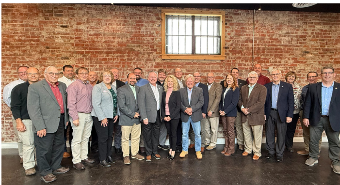
The Henry County Commissioners and Engineer hosted the fall CCAO/CEAO Northwest Region in October.