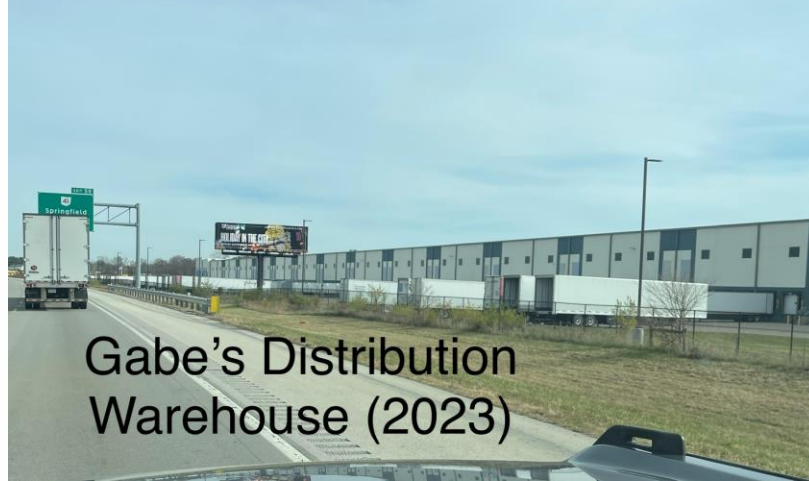
Gabe's Distribution Warehouse (2023)