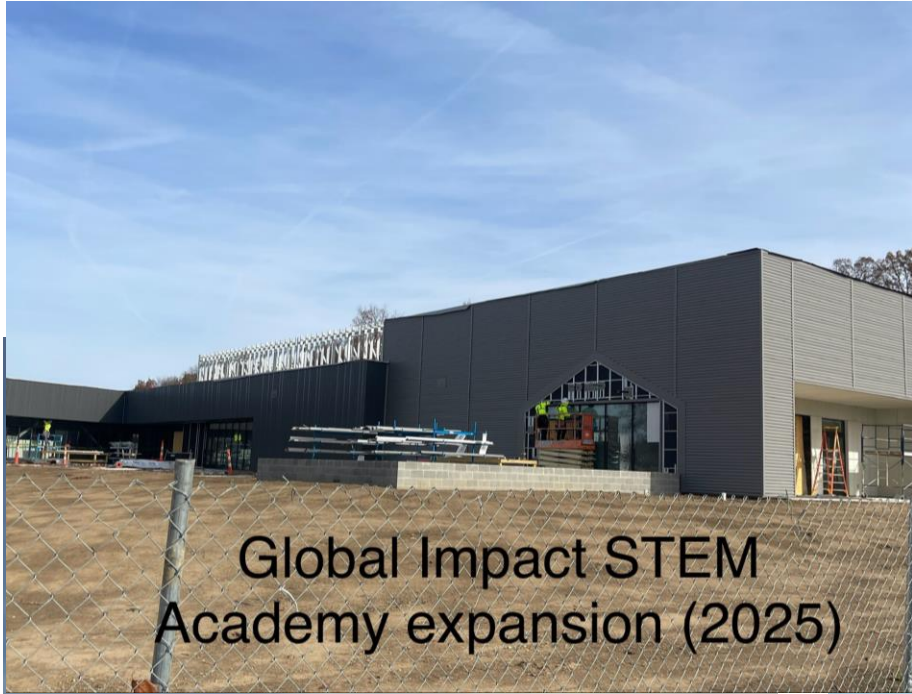
Global Impact STEM Academy expansion (2025)