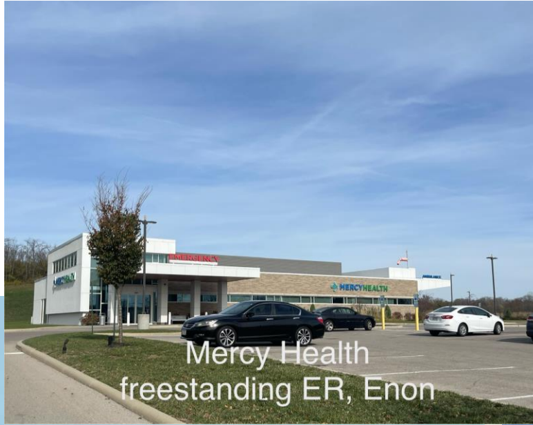
Mercy Health freestanding ER, Enon