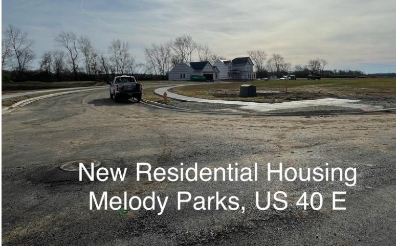
New Residential Housing Melody Parks, US 40 E