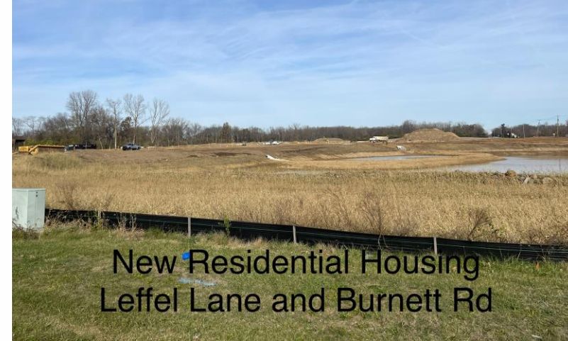
New Residential Housing Leffel Lane and Burnett Rd