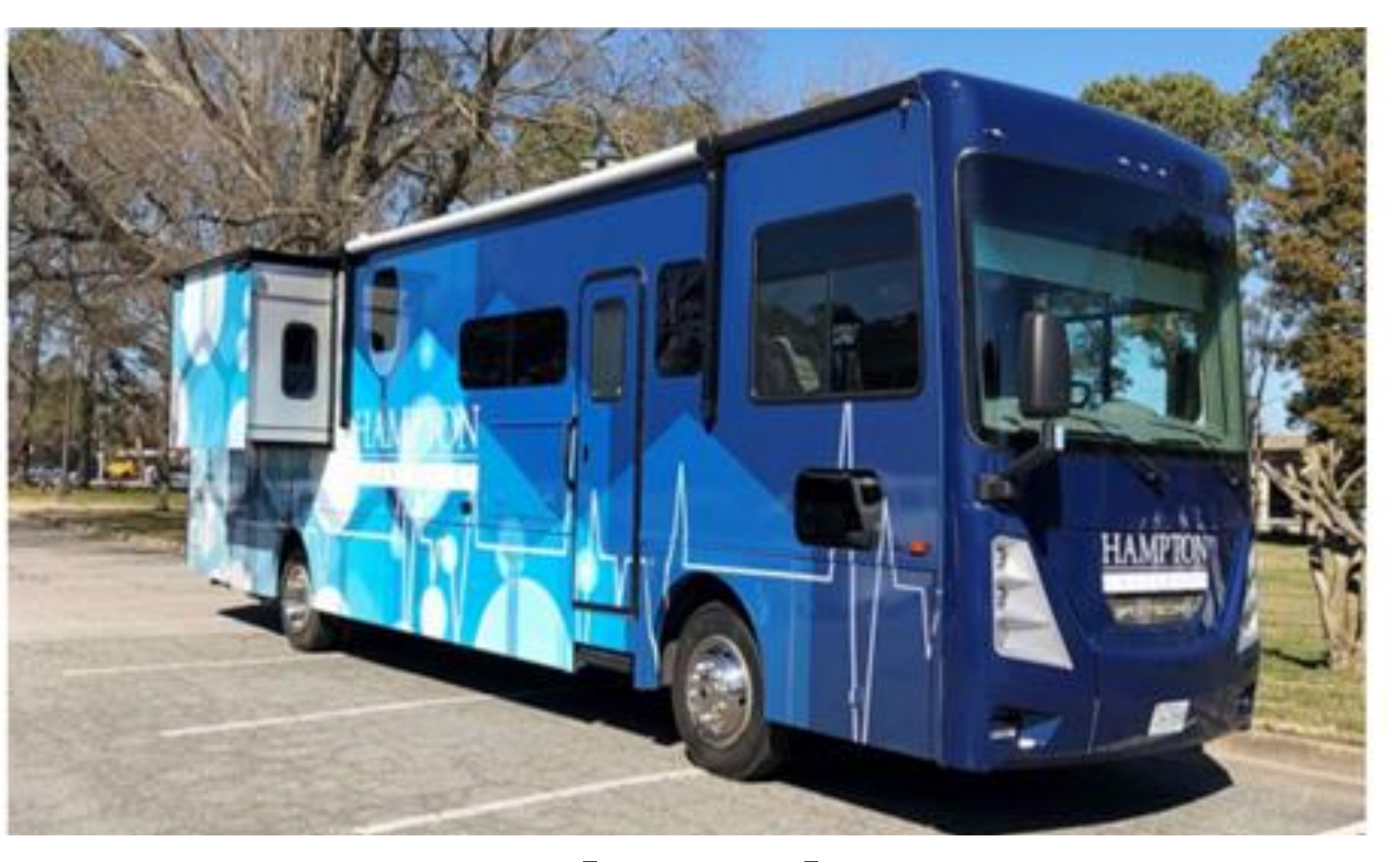
March 20th, 2021