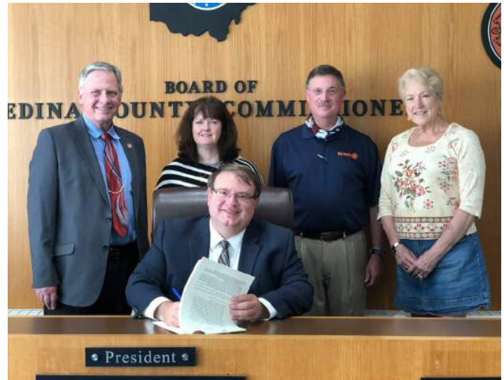
Senate President Larry Obhof signing HB 614, which in addition to creating the Unemployment Compensation Modernization and Improvement Council, also provided for the distribution of the remaining $650 million CARES Act. Also pictured are Rep. Stephen Hambley and the Medina County Commissioners.

Over the course of the summer and early fall, CCAO worked closely with other local government associations, the DeWine Administration and General Assembly on multiple bills to distribute these funds. House Bill 481 made the first distribution, allocating an initial round of $350 million. This was followed up with another distribution of $175 million from the state Controlling Board. Finally, House Bill 614 was signed in early October to distribute the final $650 million in relief funds.