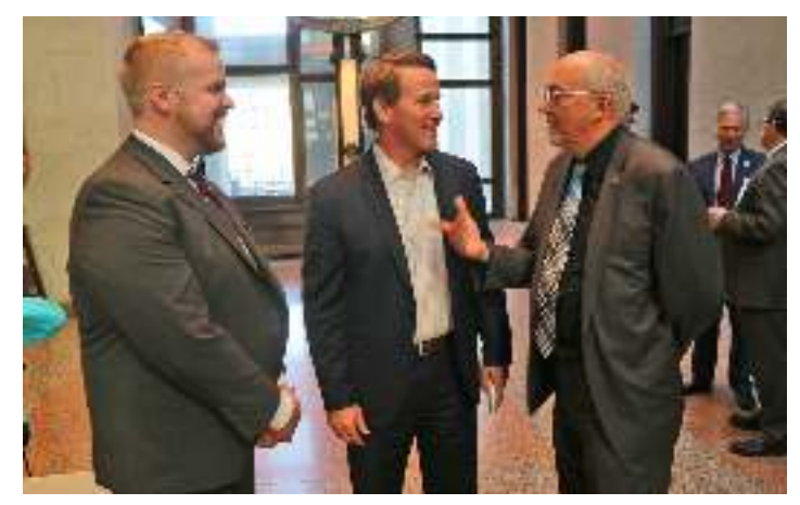
Lt .Gov Husted with Ashtabula County Commissioner Casey Kozlowski and Wayne County Commissioner Ron Amstutz

In addition, the DeWine Administration and Ohio General Assembly also made investments in Ohio's infrastructure through the transportation budget earlier this year. The tax on gasoline was increased by 10.5 cents (for a total of 38.5 cents), and the tax on diesel was increased 19 cents (for a total 47 cents). As a result, an additional