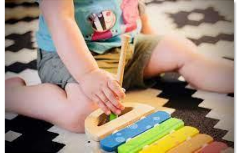
St Philomena new toddler and child care classrooms